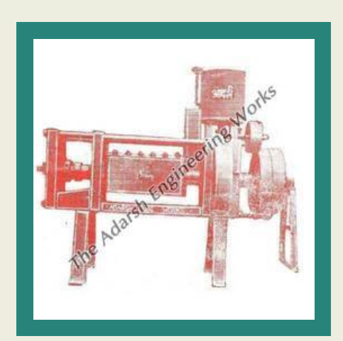
Small Scale Oil Expellers