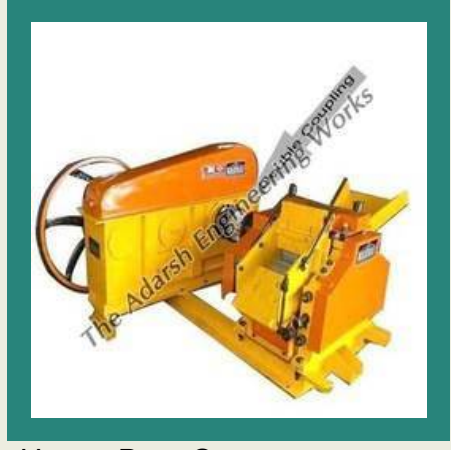
Heavy Duty Sugarcane Crusher - 25 HP