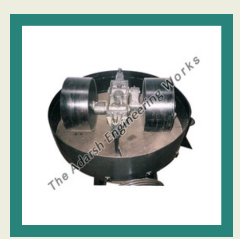
Sand Muller Mixer