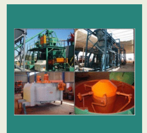
Pan Mixer for Construction Industry