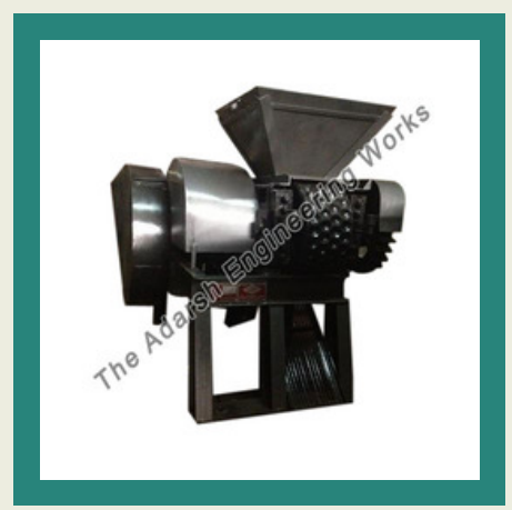
Manganese Briquetting Press

Prominent & Leading Manufacturer and Supplier from Nagpur, we offer Coal Briquetting Presses such as Manganese Briquetting Press, Coal Briquetting Press, Iron Ore Briquetting Press and Coke Briquetting Presses.