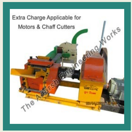
Double Coupling Type Sugarcane Crusher - 30 HP