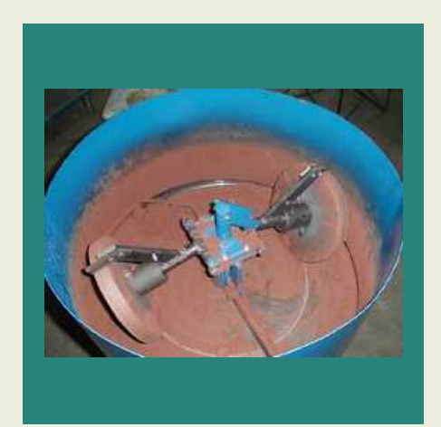
Sand Muller Mixer for Foundry Industries