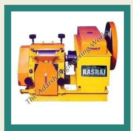
Sugarcane Crusher - 15 HP & 32 Tons