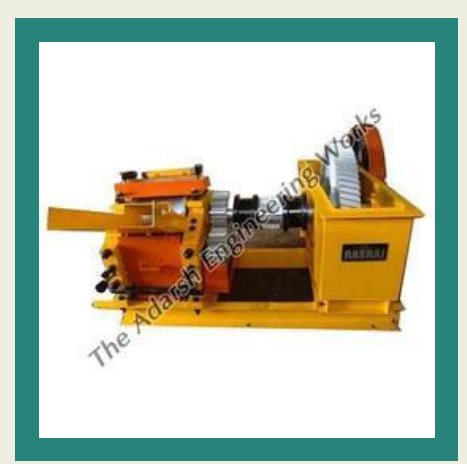
Sugarcane Juicer & Crusher - 20 HP

With the aid of advanced technology, we have been able to fabricate a range of Sugarcane Crushers Machines. These crushers machines range from 5 HP to 30 HP that are extensively used in jaggery plant and sugar factory. We also offer these crusher to the sugar cane crusher juice vendor.