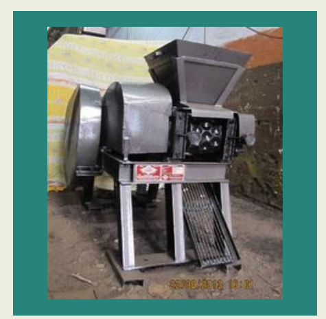
Mini Briquetting Press