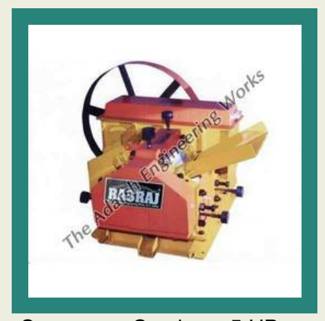
Sugarcane Crusher - 5 HP