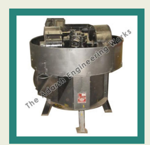
Sand Mixer Muller