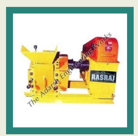
Sugarcane Crusher - 15 HP (Heavy)