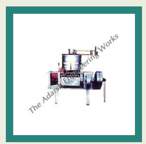
Steel Body Oil Expellers

We are instrumental in offering a wide range of Oil Expeller Machinery and Parts . These parts have reliable operations and are user friendly, which makes them ideal to be used for multiple industrial applications. Manufactured in compliance with the industry standards.