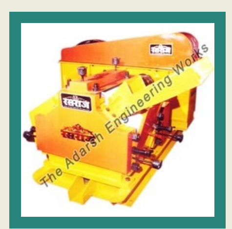
Sugar Cane Crusher Machine - 10 HP