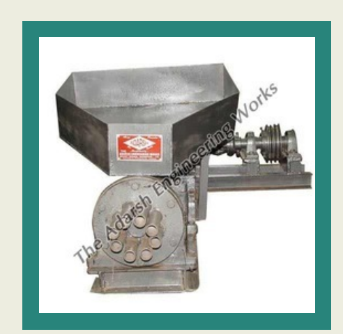
Coal Candy Machines