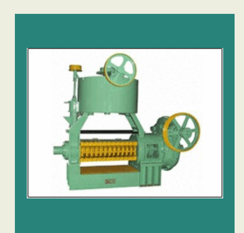
Steel Body Oil Expellers for Extracting Oil From Seed