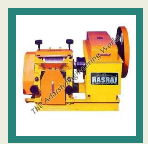
Cane Crusher Machine - 7.5 HP