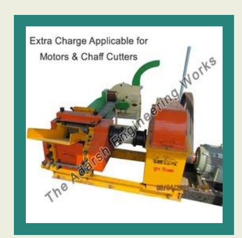
Sweet Sorghum Cane Crusher