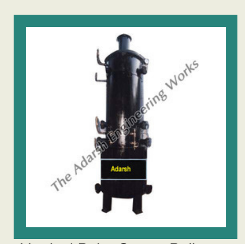
Vertical Baby Steam Boiler