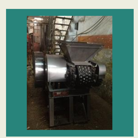
Coal Briquetting Press